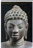
Hindu-Buddhist Sculpture of Early Southeast Asia